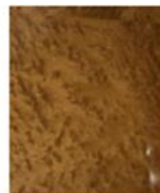
Existing Woodwork stays as is