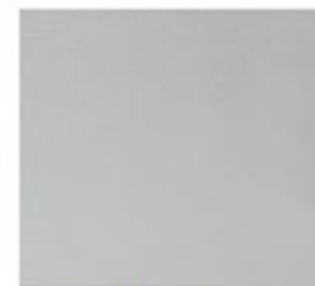
Seat Leather Garrett – Carressa C952 Platinum