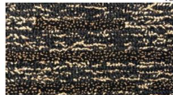
Carpet – Vector Design Tuft Collection RR-011 + RR-211

*Specifications and times are subject to verification. Aircraft offered is subject to prior sale, lease, and / or withdrawal from the market.*